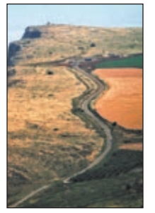
Trail follows footsteps of Jesus, F10