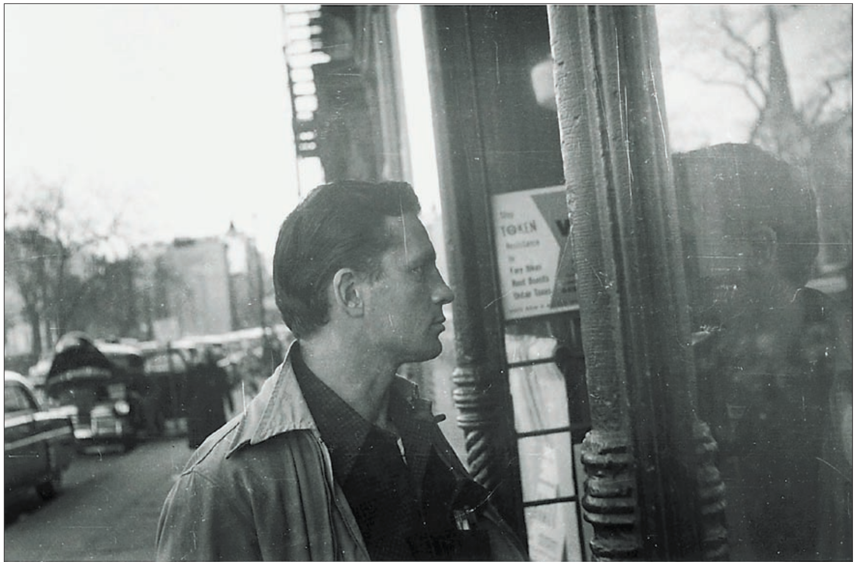
Jack Kerouac viewed A across from Thompkins [sic] Park 1953 New York, his handsome face looking into barroom door — This is best profile of his intelligence as I saw it Sacred, time of Subterraneans writing. Allen Ginsberg