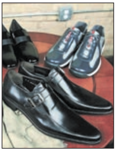
The sole of a man, F6